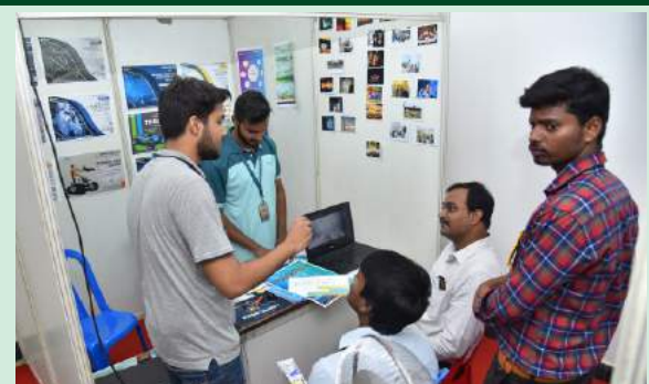
"Aaruush" Team SRM IST Students explained their projects